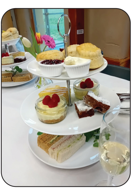
Spread for Mother's Day