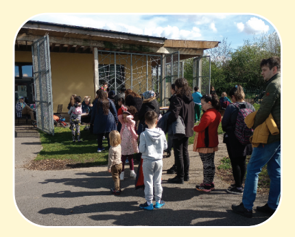
Long queue for our popular Easter Egg Hunt

During 2023 we had 19 events! Some were organised in collaboration with the Friends, such as the Wassail, Bioblitz, Flower & Produce Show, Cloud Appreciation Day and the River Event, and some were Hub Events.