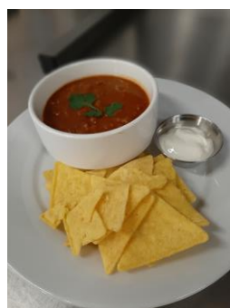
Mexican Bean Chilli comes with side salad