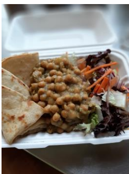
Roti and Channa Chickpea Curry